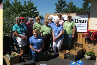
4th of July Parade

When life is easy and everything seems to fall into place, we don't learn anything. It's when a tragedy strikes and all seems to be going wrong that we learn the most valuable lessons life has to offer.